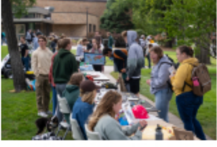
NDSU student organizations celebrate accomplishments