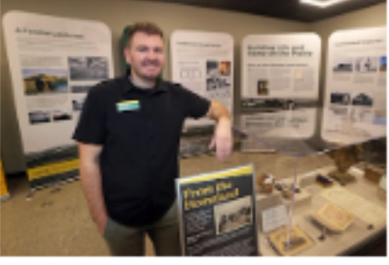
Virtual tour of Germans from Russia exhibit possible thanks to grant