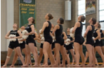
NDSU Dance Team's Road to the 'Dance Super Bowl'