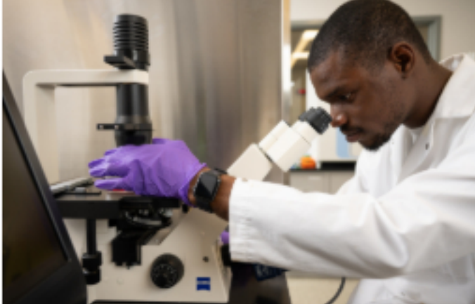
NDSU sets sixth consecutive record for annual research expenditures