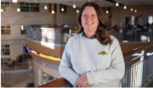
NDSU pursuing a new Center for Banking and Finance on campus