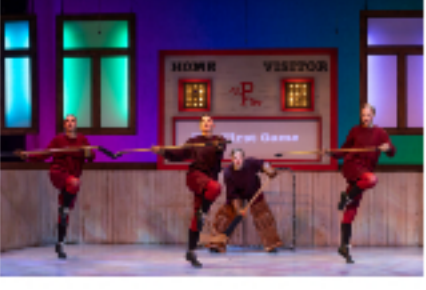
Theatre NDSU's 'Glory' receives recognition at regional theatre festival