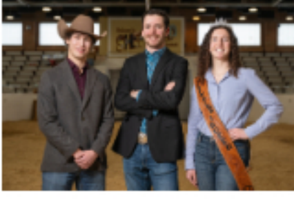
NDSU Saddle and Sirloin to host 100th annual Little International event

Read the latest campus news on the NDSU news site , or submit a news story .